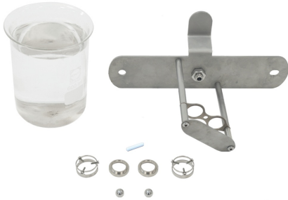
Accessories of the Automatic Ring and Ball Tester