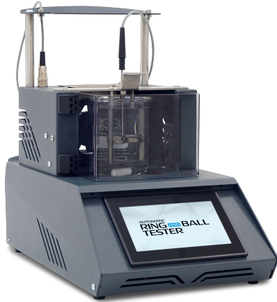
Automatic Ring and Ball Tester